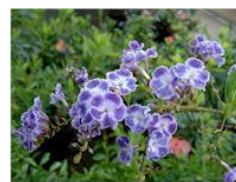
Duranta. Geisha Girl